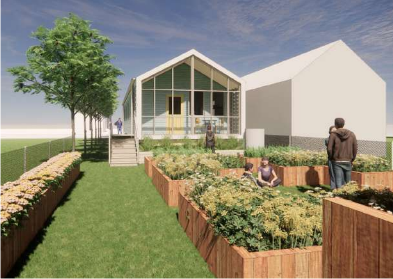
An artist rendering of Louvis Services' Edible Landscape and housing duplex in New Orleans, LA.